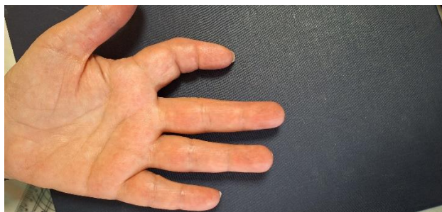
Fig.2: Patient presentation after reg joint implant