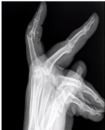
Fig.4 Xray displaying degrees of constant flexion

Article— An interesting case of PIP joint fracture of Index finger