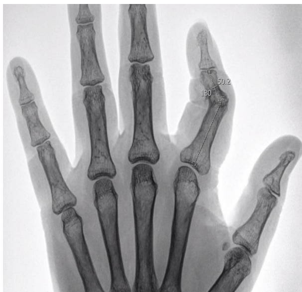
Fig.3 Xray displaying degrees of radial deviation