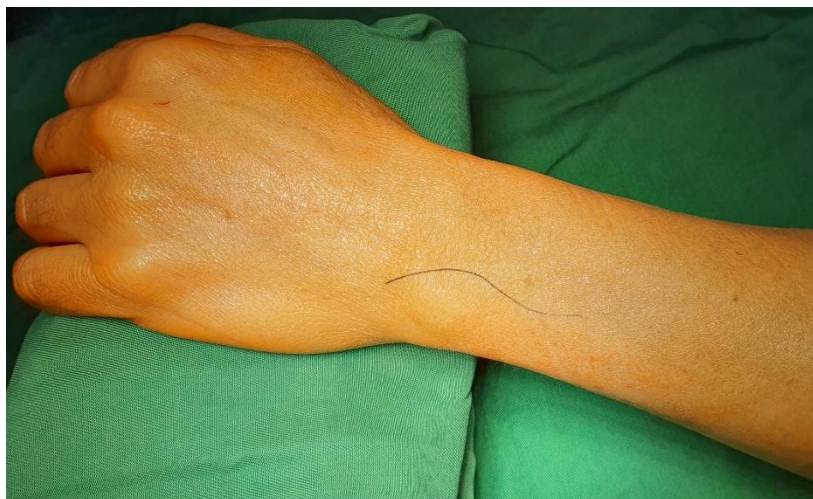
Fig.1 Lazy S dorsal access to the DRUJ between the 5th and 6th osteofibrous canals

Article — Surgical technique for anatomical reconstruction of the distal radioulnar ligaments in chronic traumatic injury of the triangular fibrocartilage complex