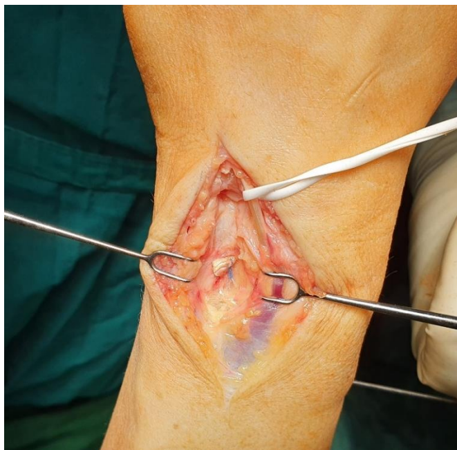
Fig. 6 Fixation of the tendon graft to the ulna using an anchor

Article — Surgical technique for anatomical reconstruction of the distal radioulnar ligaments in chronic traumatic injury of the triangular fibrocartilage complex