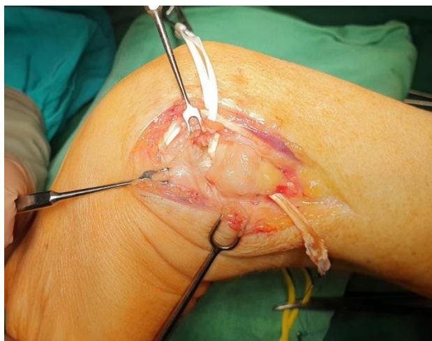
Fig. 5 Placement of a tendon graft through the bone tunnel in the ulna and tensioned to stabilize the DRUJ