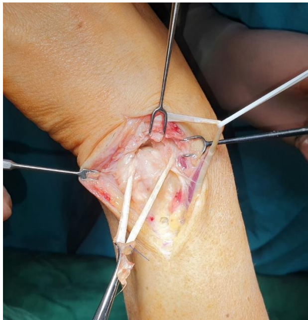
Fig. 4 Position of the tendon graft through the bone tunnel in the radius

Article — Surgical technique for anatomical reconstruction of the distal radioulnar ligaments in chronic traumatic injury of the triangular fibrocartilage complex