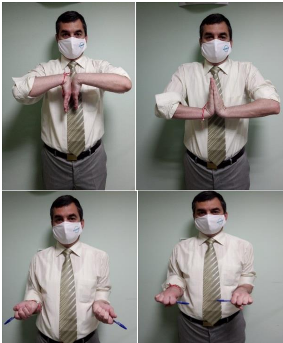
Fig.7 Functional result 4 years postoperatively

Article — Surgical technique for anatomical reconstruction of the distal radioulnar ligaments in chronic traumatic injury of the triangular fibrocartilage complex